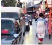
Heavy traffic in Kyoto