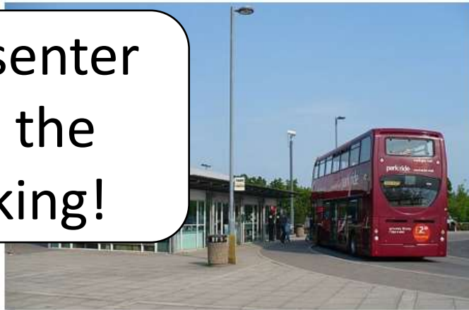
Park & Ride scheme