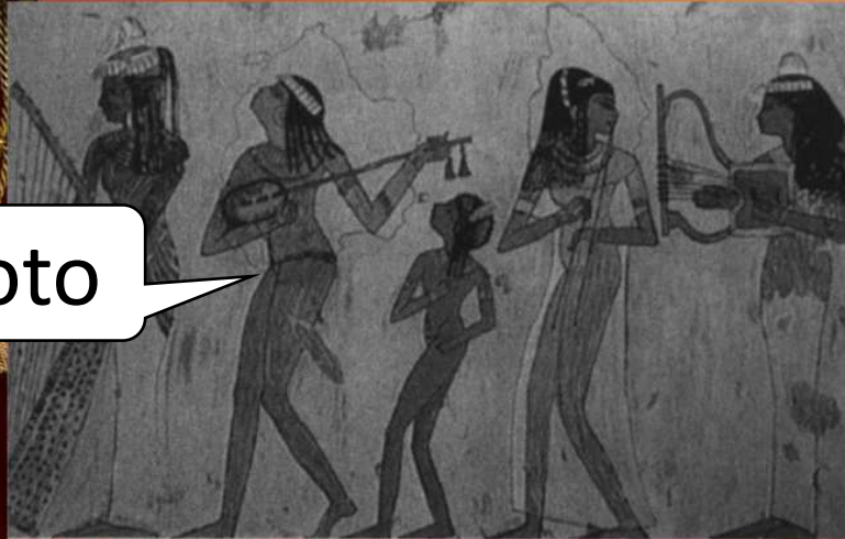
Wall painting in Egypt in the fifth B.C.