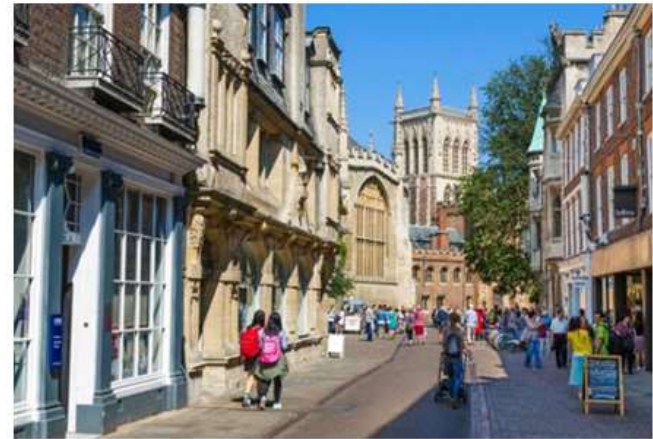
Cambridge city centre