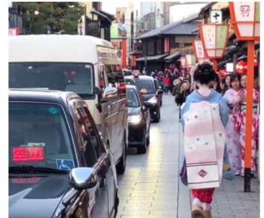
Heavy traffic in Kyoto