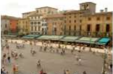
Verona city centre