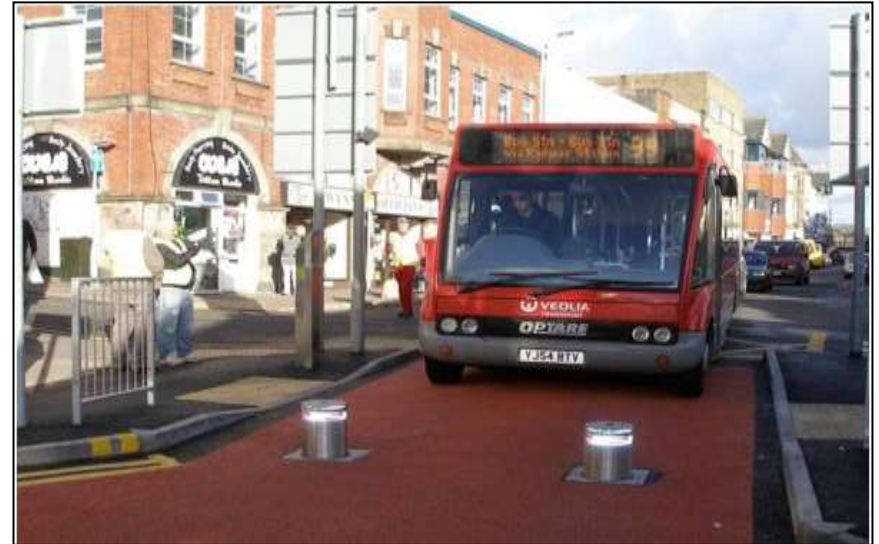
Bollards in Cambridge, UK