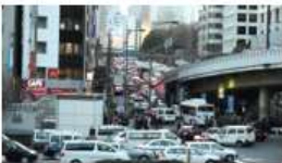
Traffic in Tokyo