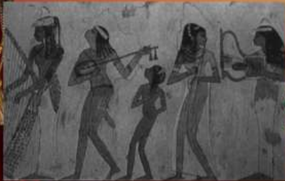
Wall painting in Egypt in the fifth B.C.