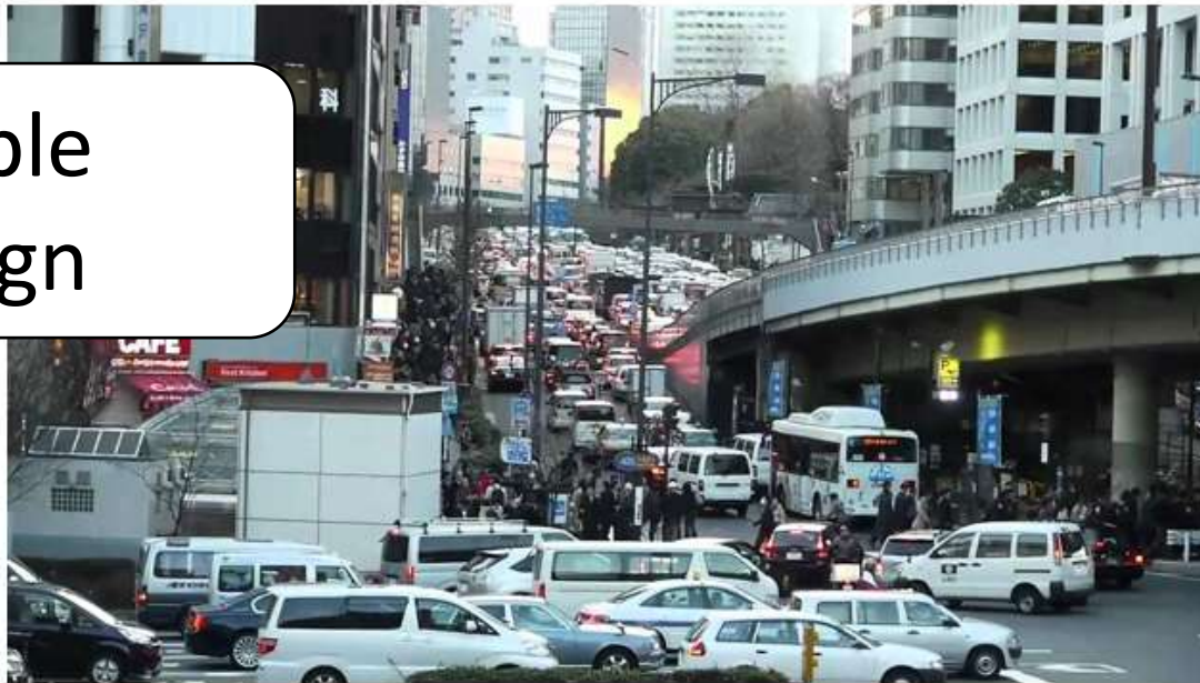
Traffic in Tokyo