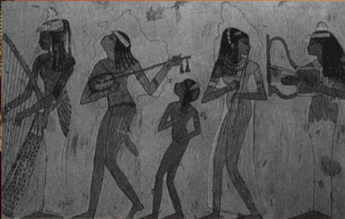
Wall painting in Egypt in the fifth B.C.